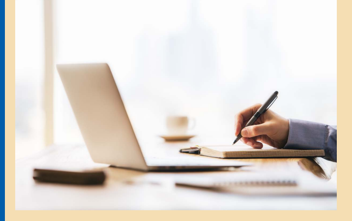
District 125 WOO-HOO Pins to be Awarded

This is not fake news! WSR seeks to train the next generation of talent to work the levers behind this very publication. Get the inside scoop - all of them in fact. Enjoy dazzling your friends with your Rotary knowledge and event recall. Contact Lynn at 614-745-7320 for more info. No experience required. Promise, we'll train you.